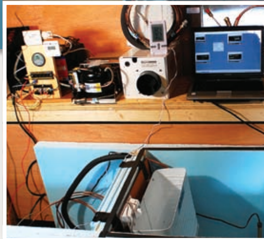
Temperature sensors fed into data-logging software on a laptop to chart cooling efficiency.

The first performance test measured the amount of time and amp-hours required to cool a 60-degree box down to 40 degrees. The second test measured the amount of energy required to maintain the box at 40 degrees for 12 hours, with ambient temperatures at 60 degrees. Cooling capacity was tested by cooling a 90-degree gallon jug of water down to 42 degrees, tracking both time and energy consumed in amp-hours.