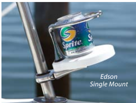
Edson Single Mount