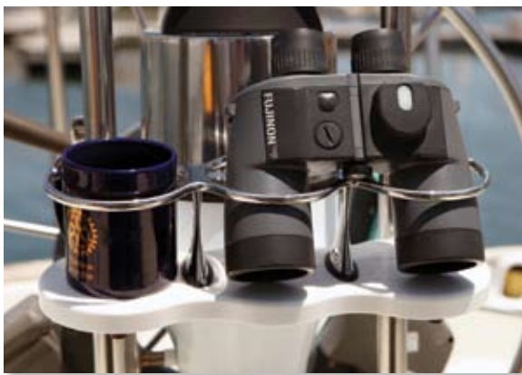
Edson Triple Starboard Binnacle Mount