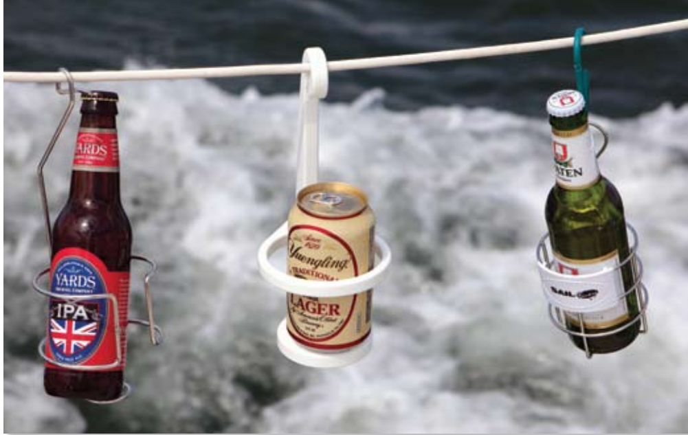
While many of the tested drink holders will hold a beer can or bottle, a water bottle is a wiser choice while underway. Lifeline-mounted drink holders like the (from left) Sail-a-long, SnapIt, and Sail-Buoy are well-suited to cockpits tight on space.

Manufacturers represented in this test included Edson International, Orbex, Handi-Man Marine, Sea-Fit Inc., and SnapIt Products. Massachusetts-based Edson, well-known for its quality ma-