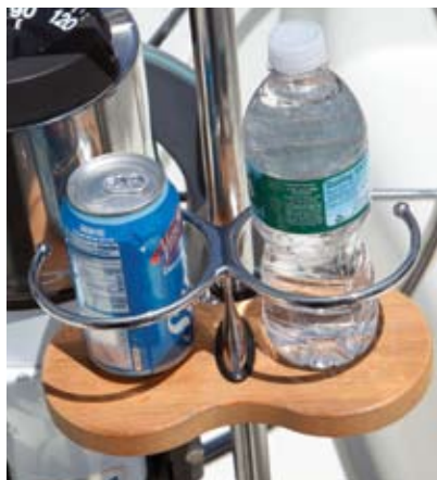
Edson Double Teak Binnacle Mount