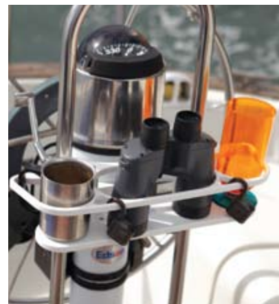
SnapIt Binnacle Mount