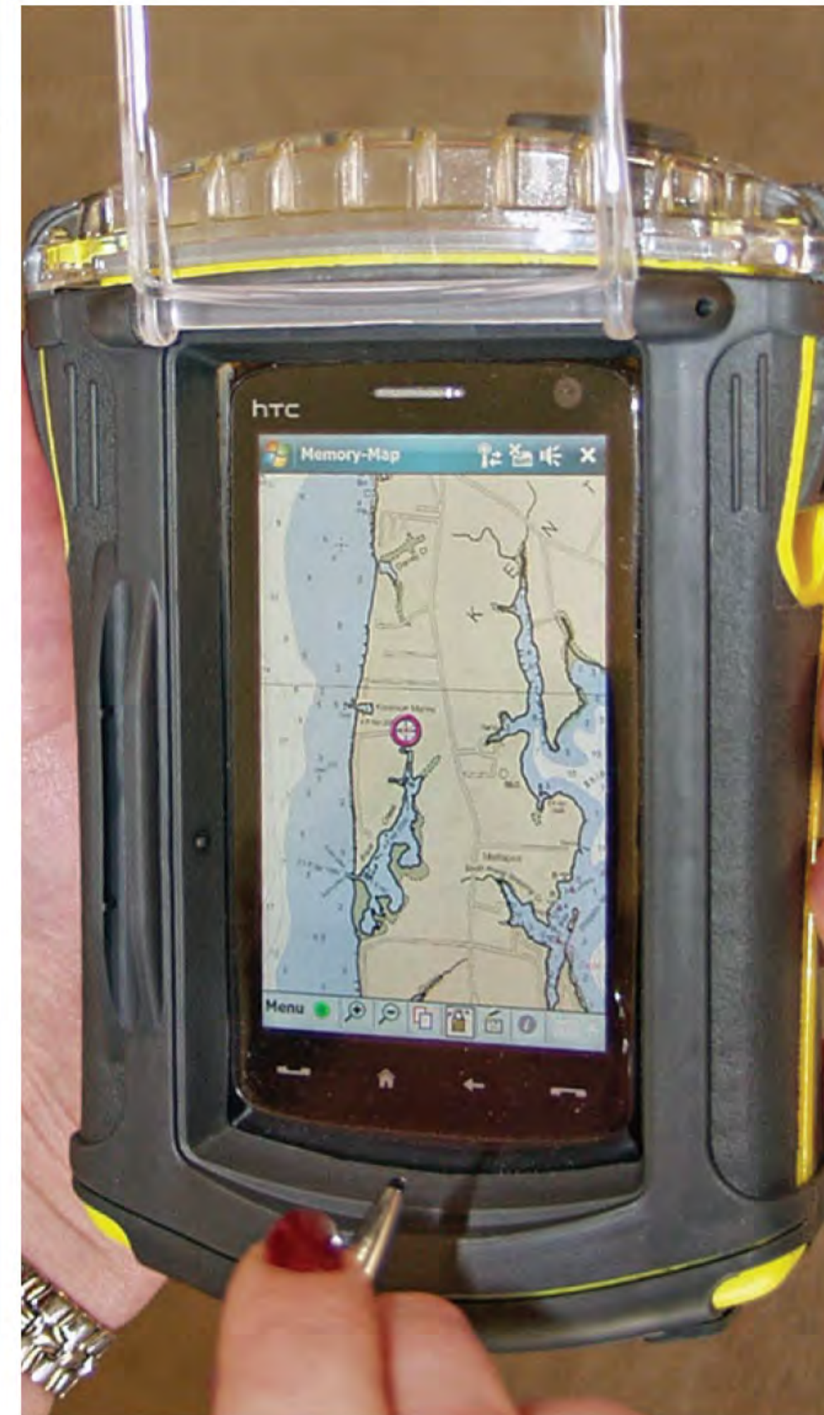
Otterbox 1900 with HTC Touch HD