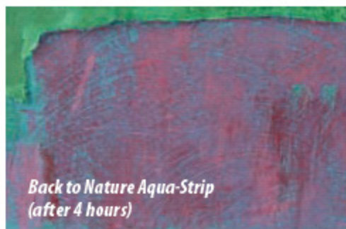
Back to Nature Aqua-Strip (after 4 hours)