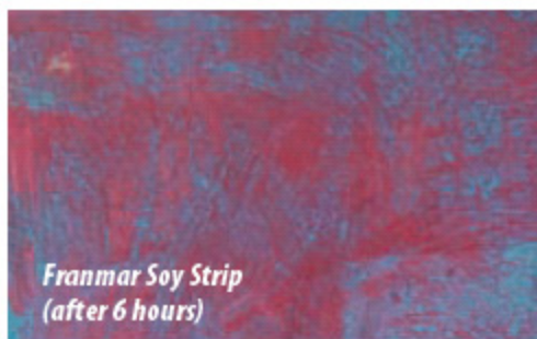
Franmar Soy Strip (after 6 hours)

The hull of our test boat made a perfect platform for comparing the strippers' performances: The original gelcoat was red, and the bottom paint was blue. These pictures show just how much paint our top strippers took off. In our test, the environmentally friendly Franmar's Soy Strip removed the most paint in the shortest amount of time: 90 percent after 30 minutes. Ready-Strip and Aqua-Strip, both made by Back to Nature, were our runners-up, with the Ready-Strip taking Budget Buy honors. In the group of strippers that needed less than two hours' dwell time, Pettit's Bio-Blast led the pack, edging out Interlux's Interstrip.