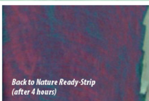
Back to Nature Ready-Strip (after 4 hours)