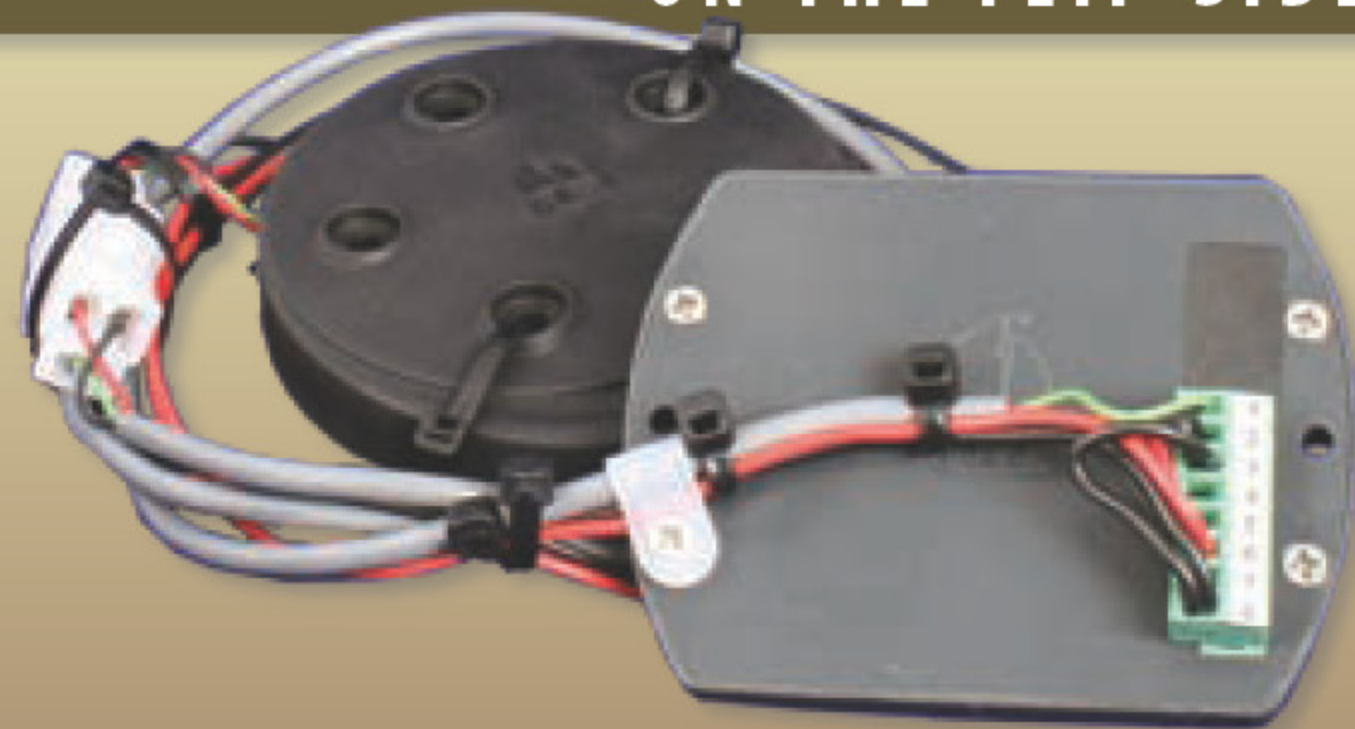
BEP Marine TS1