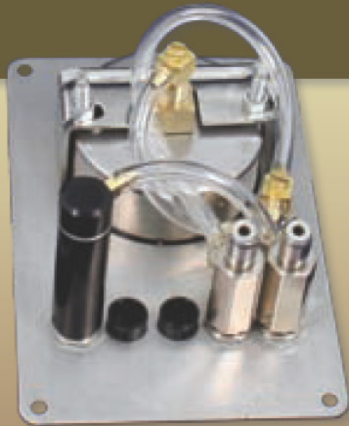
Hart Tank Tender