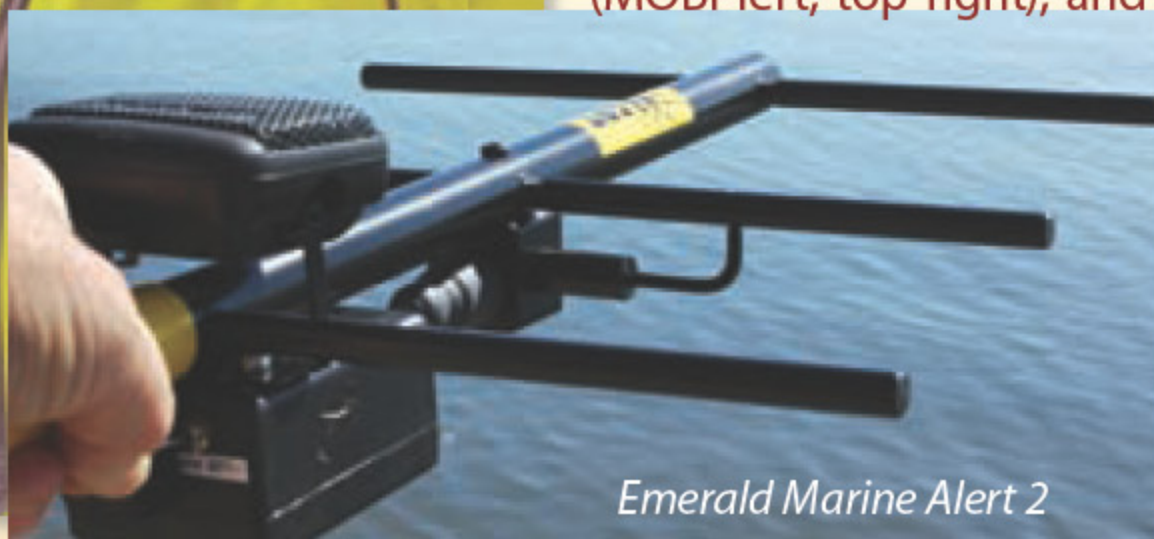
Emerald Marine Alert 2