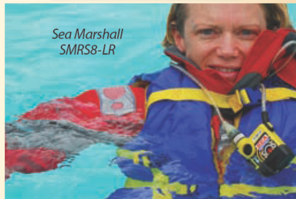
Sea Marshall SMRS8-LR